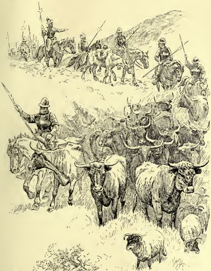
The troop returning with its booty